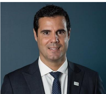
Gustavo González de Vega Deputy Minister of Economy and Internationalization - Government of the Canary Islands

Panel 3: Global Bridges: Connecting the Americas, Africa and the Middle East to boost business between MSMEs